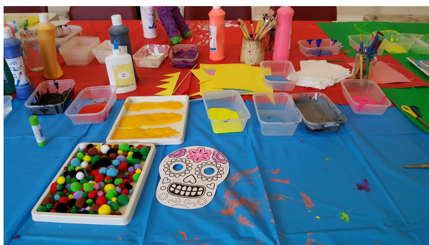
CANDY craft workshop with Sabrina