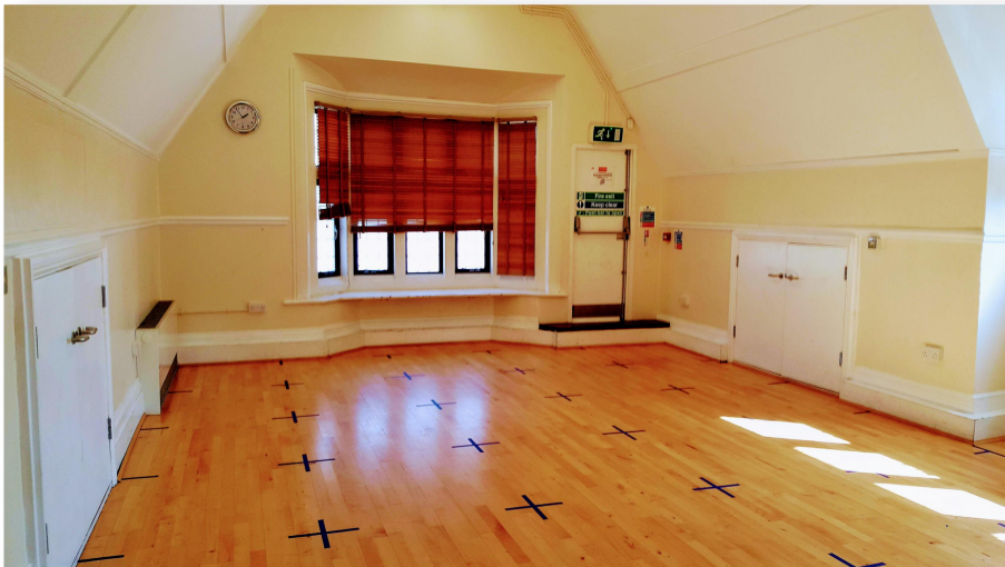
The CAWH hall available for hire

During the year, we also initiated several local activities which raised funds, including talks and quizzes, and a CAWH 101 Club. Our total funding was £76,022, and expenditure £71,521, leaving a surplus of £4,501. However, £12,702 was restricted income devoted to children's work which was to be carried forward to the next year. CAWH has been able to maintain its unrestricted funding at nearly the same level as the previous year, and holds £60,634 unrestricted reserves at the end of the financial year. 2021-22 will be a critical year, as it is essential we secure 3 to 4 year project funding, with associated core costs, in order to keep the organisation open and to continue to provide our services.