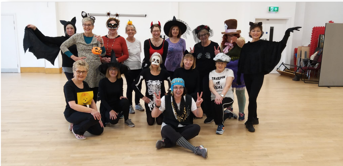
Halloween Dance for Fitness Class