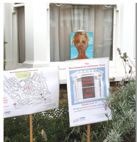
Picture Windows Art Trail 2021

From the beginning until this current day, I have been impressed by the dedication and support of CAWH staff, Trustees, tutors and volunteers in keeping the community centre alive both online during national restrictions, and then face to face as restrictions eased.