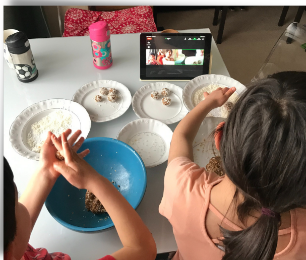
Making Energy Bites with Sabrina on Zoom

The After School Playscheme at West Hampstead Primary School, was closed at the request of the school for the whole year, but after the initial lockdown, a wide range of activities were provided for children. These were of three types: Online activities, 1:1 outdoor sessions and Nature Home Kits. Initially activities were on Zoom, and focussed on art, food and creative activities such as birdhouse making, flowerpot painting, and basket weaving. Later, there was a demand for outside activities, and football training and cycle training were very popular. Home kits were developed to encourage